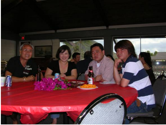
June 3, 2006: Odawara JC Farewell Party