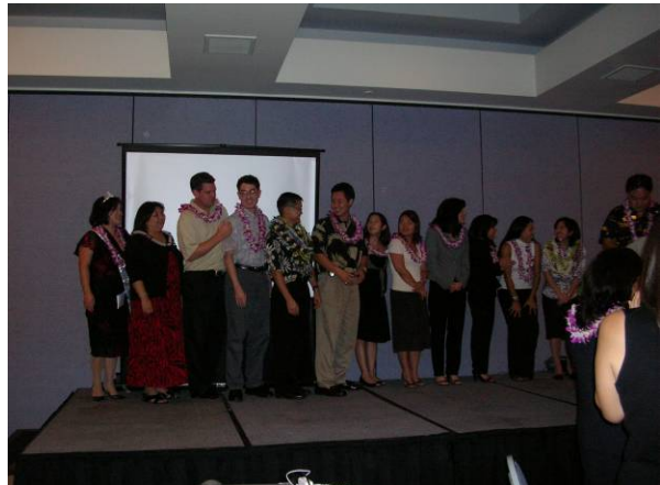
July 27, 2006: HJCC Installation Banquet