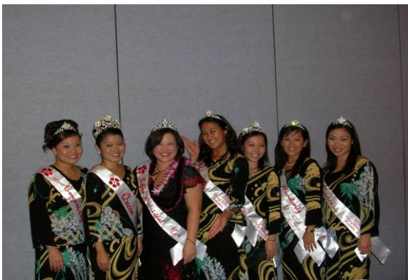
July 27, 2006: 56 th HJCC President Casey and 54 th Court