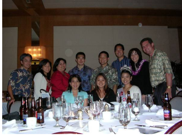
July 7, 2006: HJCC Installation Banquet