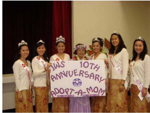
Japanese Women's Society Adopt-a-Mom