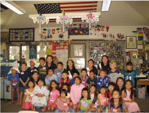
Children's Day at Punahou School