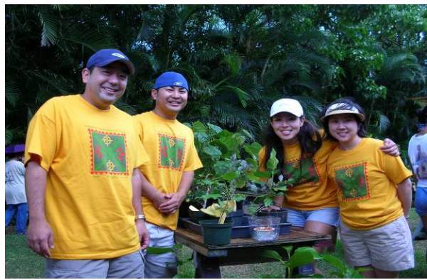
August 5, 2006: Board of Water Supply Un-thirsty plant sale