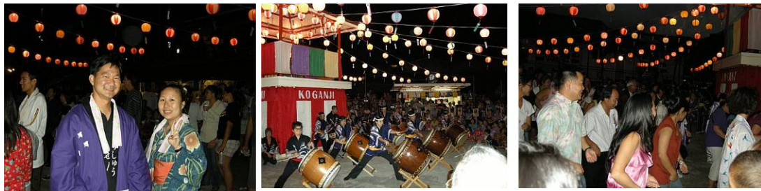
HJCC members took a break from official duties and attended the Koganji Bon Dance on Friday, August 1 st .