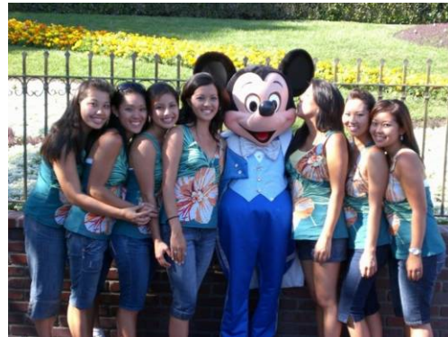
The Court with Mickey at the "Happiest Place on Earth"!