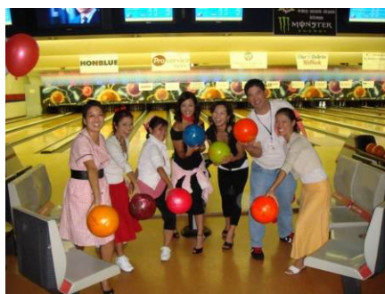
Big Brothers Big Sisters of Honolulu Bowl for Kids Sake

Another fun and memorable event was the Bowl for Kids Sake, a fundraiser for the Big Brothers and Big Sisters of Honolulu. Dressing in attire from the movie Grease the court helped to make the Hollywood Bowl themed event a success. From emceeing, serving food and selling raffle tickets, the court had a great time.