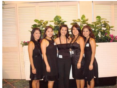
Court members at the Waikiki Community Center’s Na Mea Makamae O Waikiki fundraiser

Members of the court were “divas doing good” as they participated in the Go Green Fashion Show which supported Kanu Hawaii. Strutting their stuff in the latest fashions the court helped to raise money and awareness of the importance of taking care of the environment.