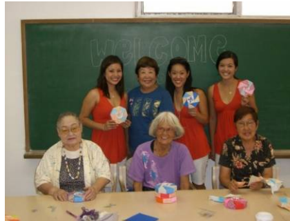
Court members with students from their origami workshop at the Waikiki Community Center

A favorite event of the court was their next community service event, teaching an origami class to seniors at the Waikiki Community Center. The four students enjoyed learning from and socializing with the court members.