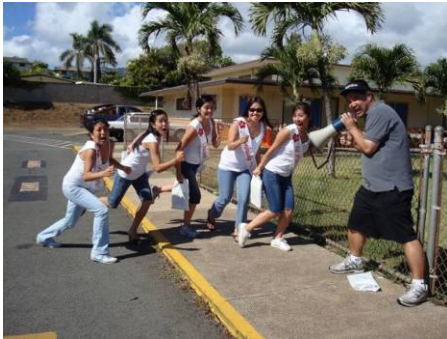
The Court running at the Lanikai Bike Path Fun Run