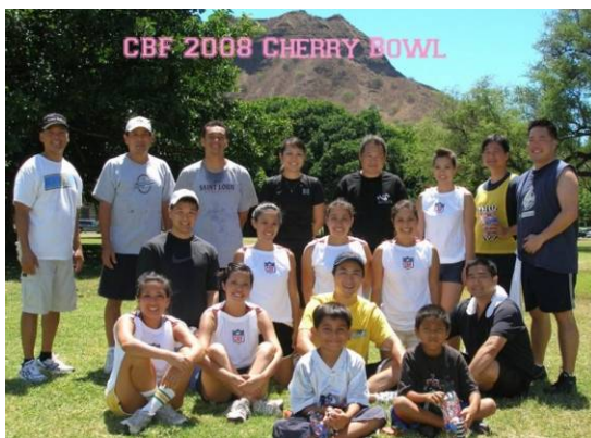
Participants of the inaugural Cherry Bowl 2008